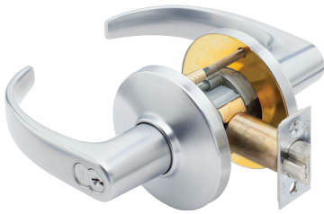
BEST 9K Series Heavy Duty Cylindrical Locks