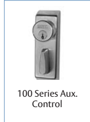
100 Series Aux. Control