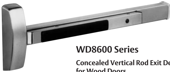
WD8600 Series Concealed Vertical Rod Exit Device for Wood Doors