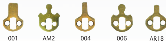
001 AM2 004 006 AR18