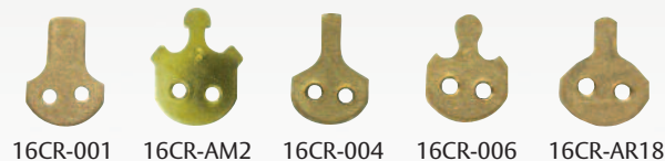
16CR-001 16CR-AM2 16CR-004 16CR-006 16CR-AR18