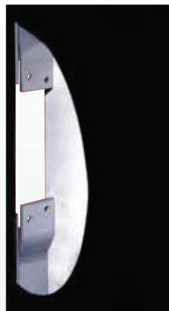
As seen from the inside of the door looking out.

SOSS OFFERS READY-MADE REINFORCEMENTS FOR EASY PREP OF STEEL DOORS.