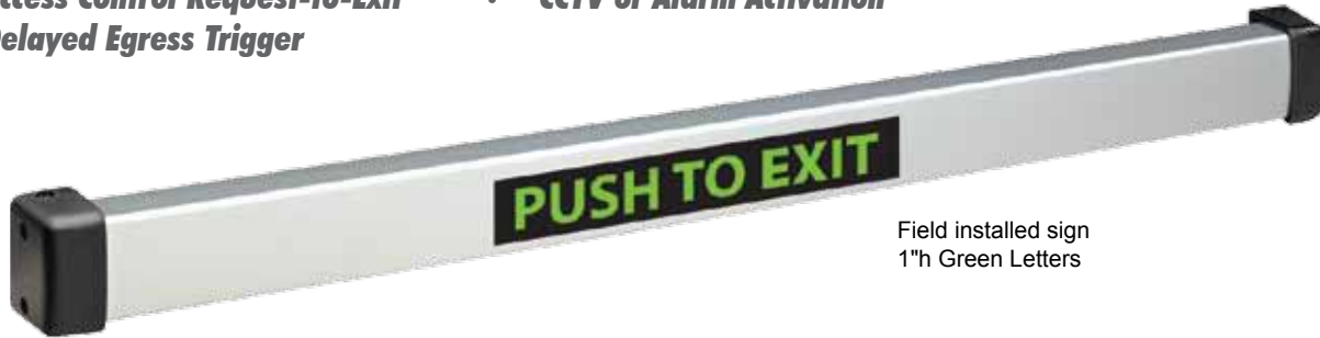
Field installed sign 1" h Green Letters