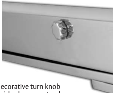
Decorative turn knob finished same as track