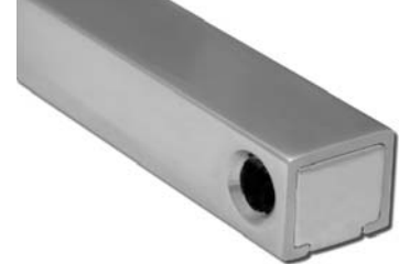
Finished end caps recessed in channel