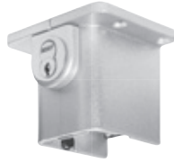
Key Removable Mullion Cap KMC822 (Rim Cylinder required)