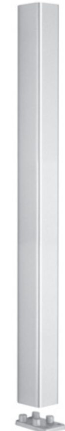
Mullion Cap MC811