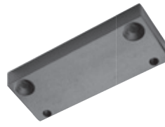
Mullion Cap Spacer MCS822