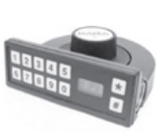
Keypad Inverted KI