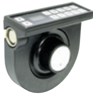
Keypad Up KU