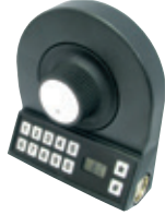
Keypad Down KD