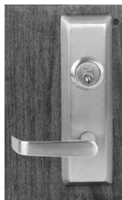
Heavy-Duty Exit Device Trim 626F with K840 Cylinder and KP4 Collar