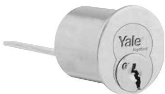
Complete Rim Cylinder (LFIC)

For use with exit devices and auxiliary locking devices.