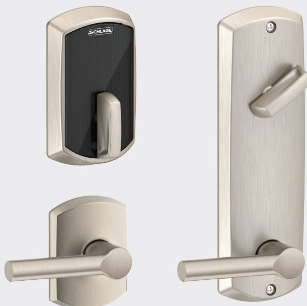
Schlage Control™ Smart Interconnect Lock with Greenwich trim in Satin Nickel with Broadway Lever