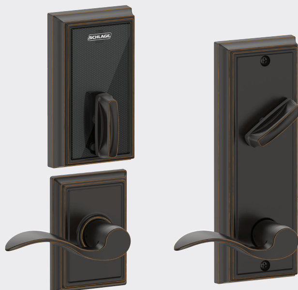
Schlage Control™ Smart Interconnect Lock with Addison trim in Aged Bronze with Accent lever