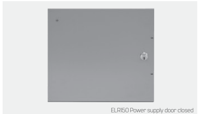
ELR150 Power supply door closed