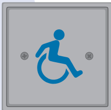
#59-WSS (Stainless Steel with Blue Legend)