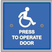
#59-H (Blue Background with White Legend)