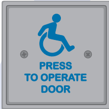
#59-HSS (Stainless Steel with Blue Legend)