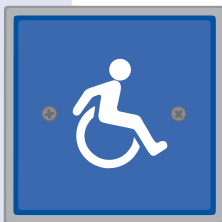
#59-W (Blue Background with White Legend)