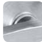
625 Bright chrome