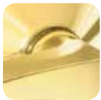
605 Bright brass