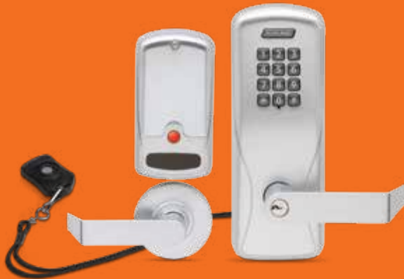
CO-220 classroom lockdown solution